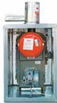
Sealed System Option Available Up to 150,000 Btu's